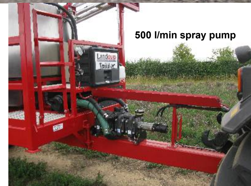
500 l/min spray pump

PTO driven options include the above 500 and 1300 l/min. pumps