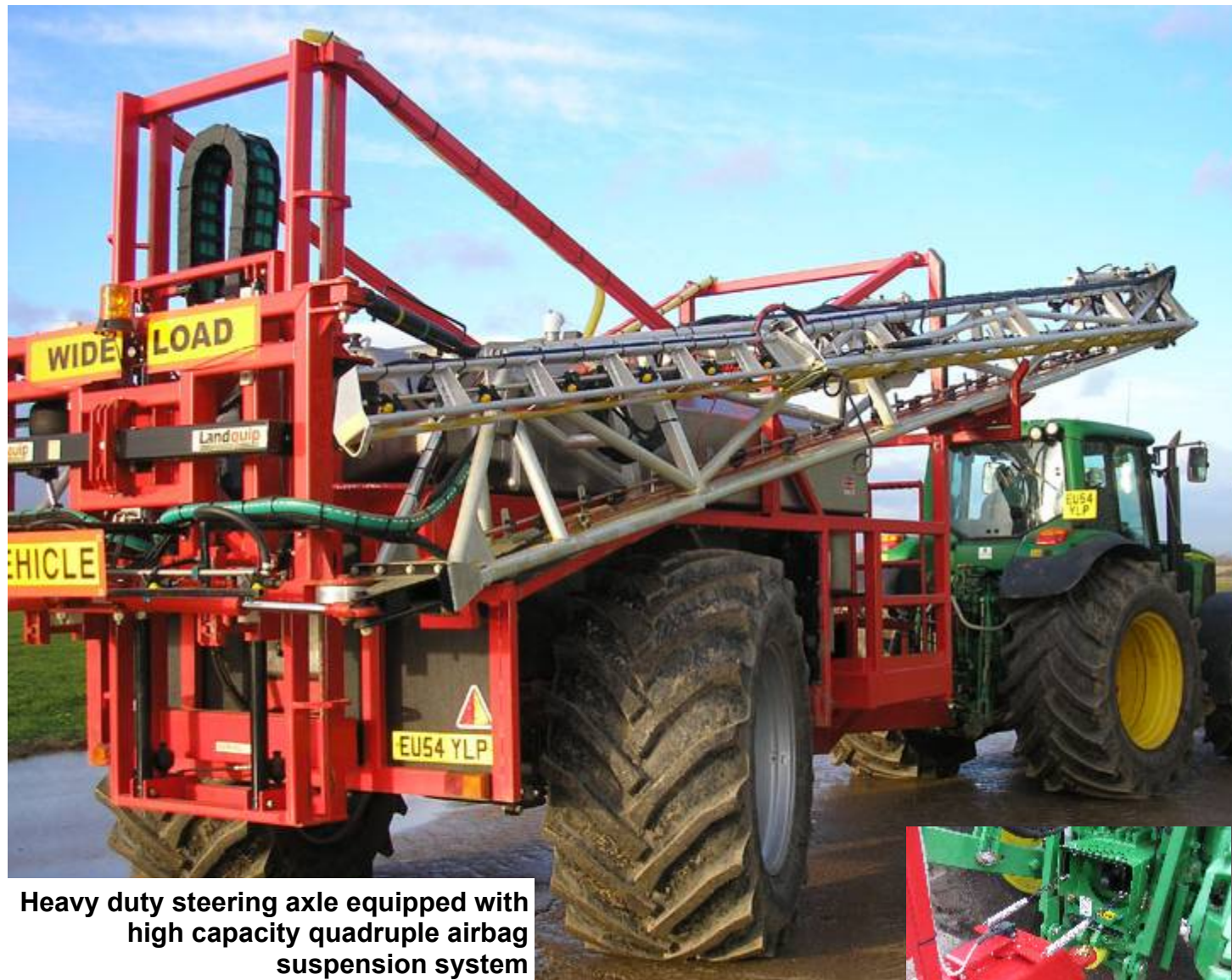
Heavy duty steering axle equipped with high capacity quadruple airbag suspension system