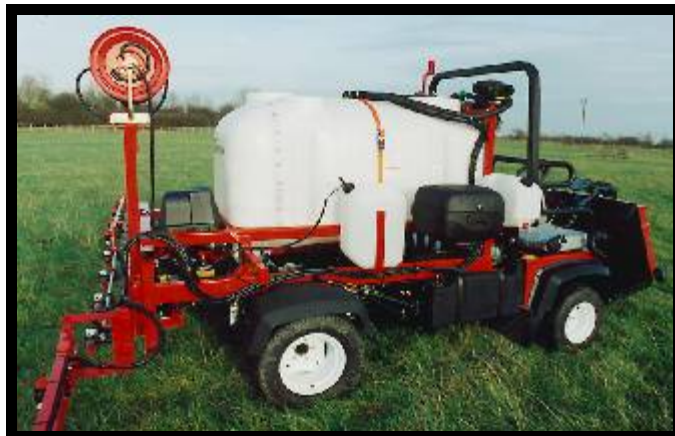
Toro 850 litre Demount equipped with 6 metre boom, hosereel & boutmarker