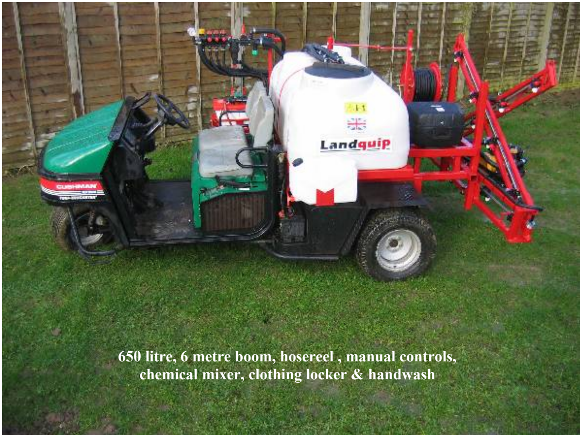
650 litre, 6 metre boom, hosereel , manual controls, chemical mixer, clothing locker & handwash

Landquip Turf Care sprayers are used throughout Europe for golf courses, amenity applications, sports and recreation fields, and forestry operations (such as Christmas tree and bracken maintenance)