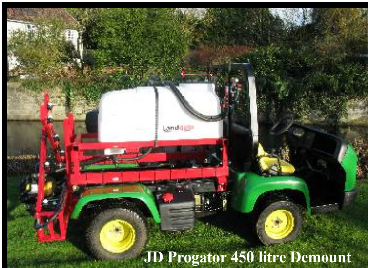
JD Progator 450 litre Demount