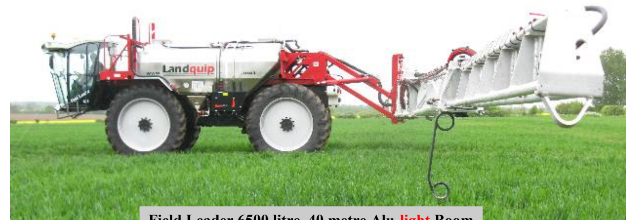
Field Leader 6500 litre, 40 metre Alu-light Boom